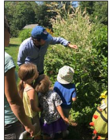
Little Sprouts finding pollinators in the Herb Garden.

Parents can sign up online by visiting www.merryspring.org and clicking on the link on the Summer Ecology Camps page.