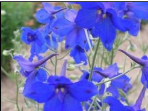
Delphinium 'Blue Butterfly' is a gorgeous color.