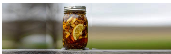
Herbal Bitters for Digestive Health with Melanie Scofield