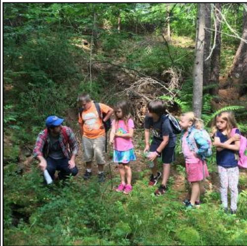
Eco-Explorers investigating the Merry Spring.

After two summers with no camps because of Covid restrictions, Merryspring and Knox-Lincoln Soil & Water Conservation District (KSLWCD) are excited to bring back these popular programs in 2022. Summer Ecology Camps offer exciting, outdoor nature experiences for young children. Through gardening, games, experiments, and observation, campers enjoy an introduction to