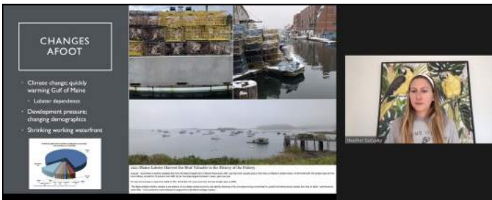
Maine Aquaculture Hub with Heather Sadusky