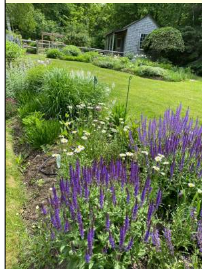
Sage in bloom at Merryspring.