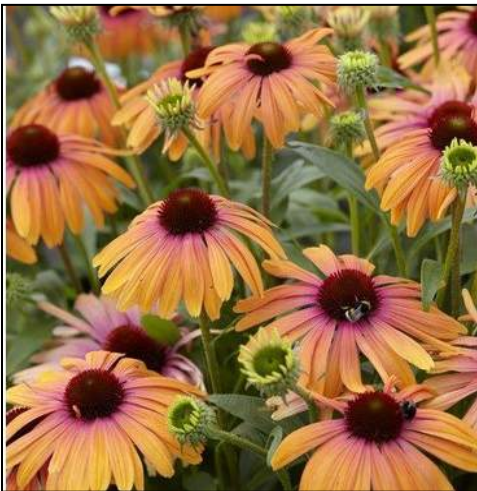
Echinacea 'Rainbow Marcella' is one of many plants that will be available at the Plant Sale.