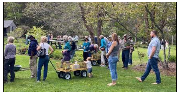
Merryspring's Plant Sale always draws a crowd.

Our selection of herbs includes all the favorites, including basil, sage, and rosemary. We'll also have a variety of vegetable seedlings from lettuce and tomatoes to onions and peppers, Merryspring members will receive a 10% discount on all plant purchases. Non-members can take advantage of that same discount by becoming members during the Plant Sale.