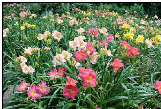
Merryspring's Daylily Garden in bloom.